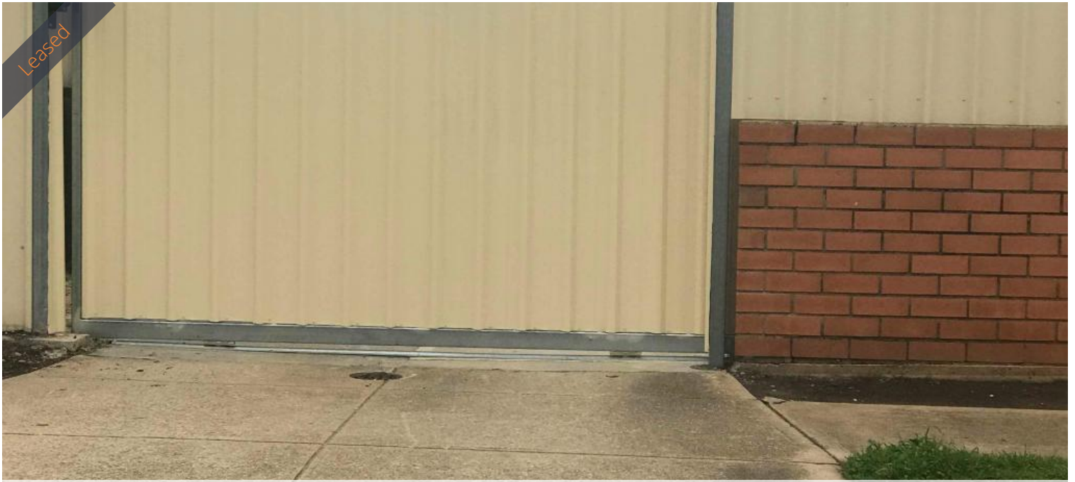
Unit 1, 11 Frederick St, Mansfield Park